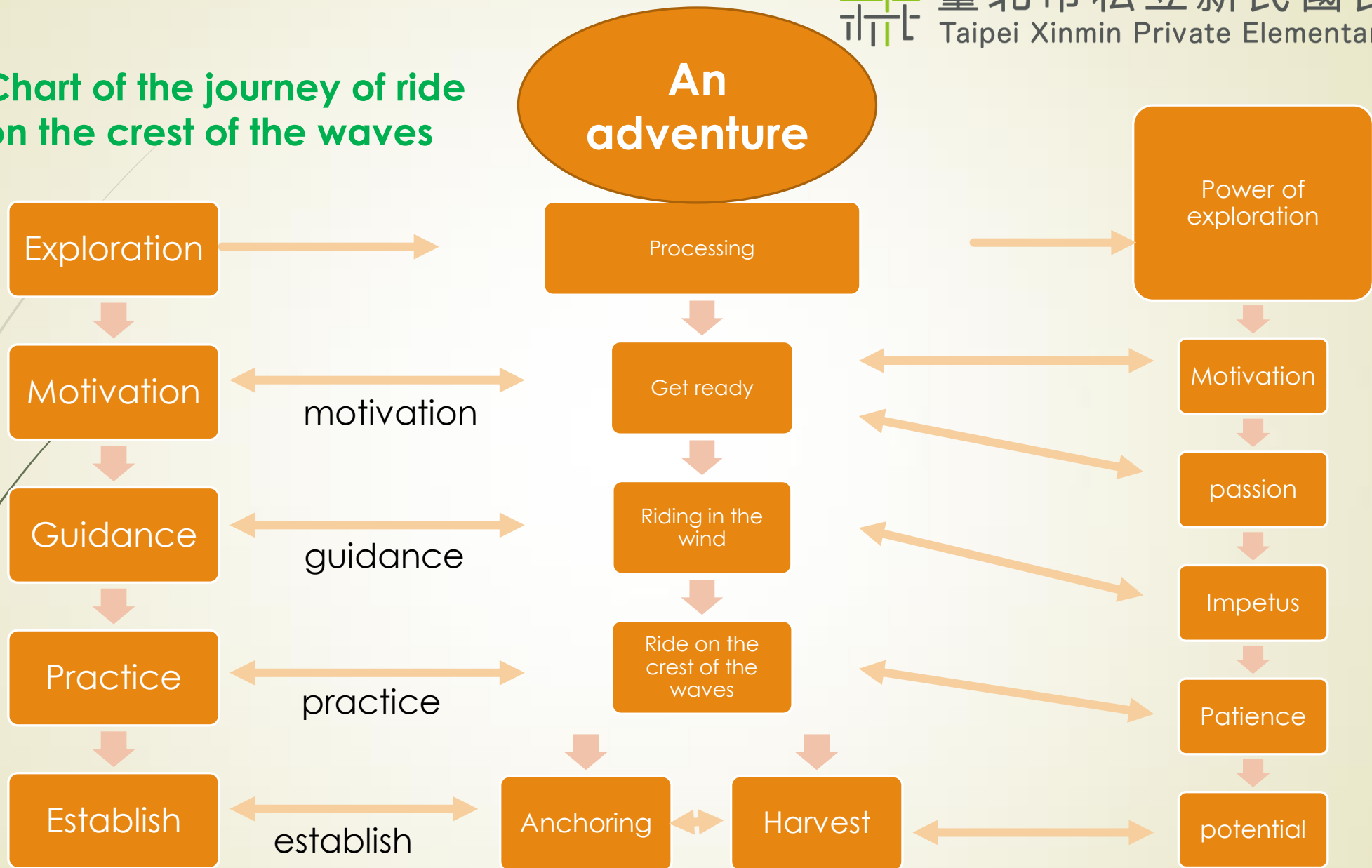
Chart of the journey of ride on the crest of the waves