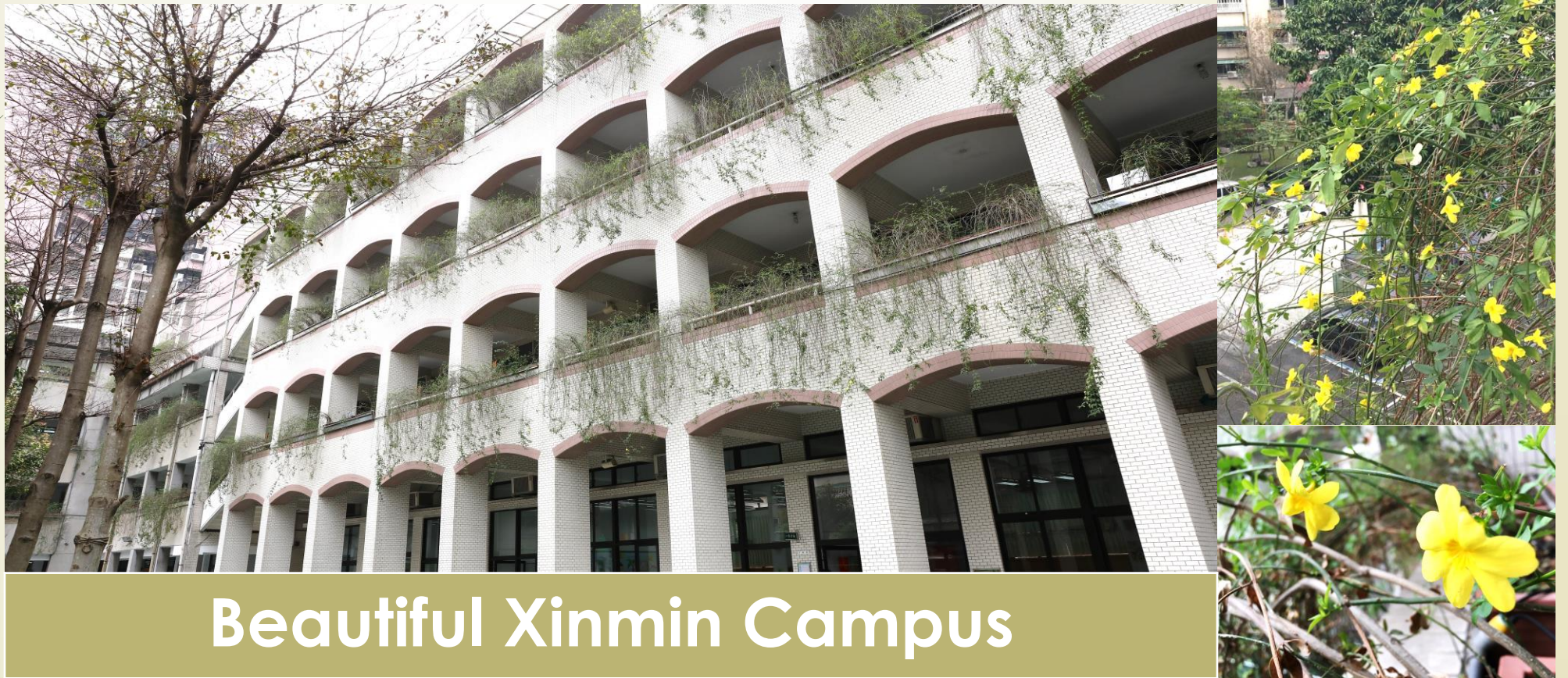
Beautiful Xinmin Campus